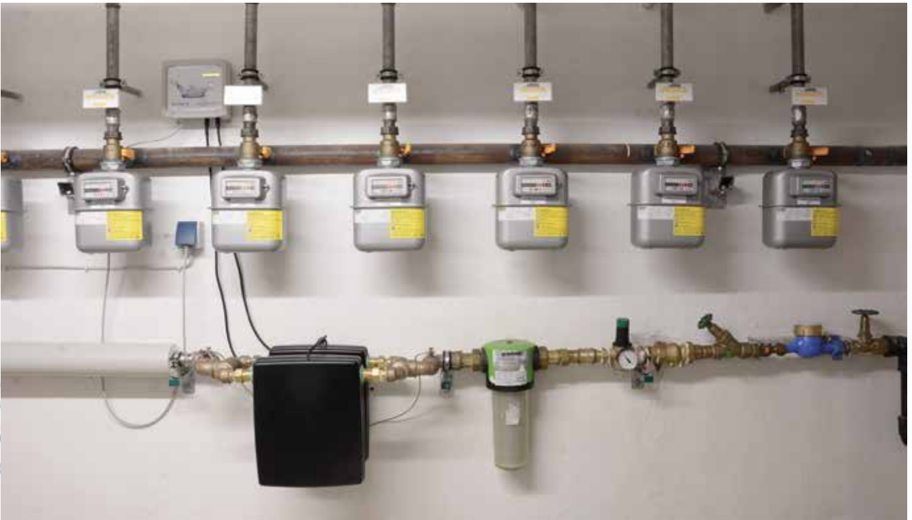
Apartment block with 10 residential units, Würzburg region, Property management: Eichhorn Immobilien GmbH