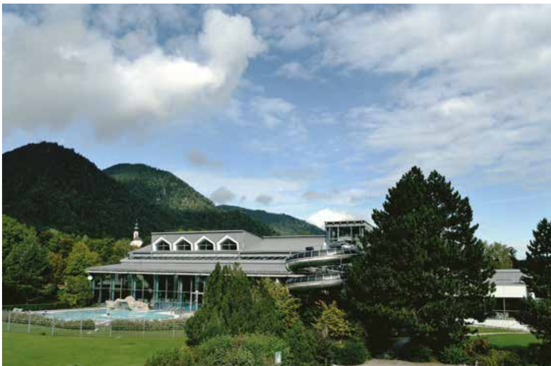
Vita Alpina – Water park & spa, Ruhpolding