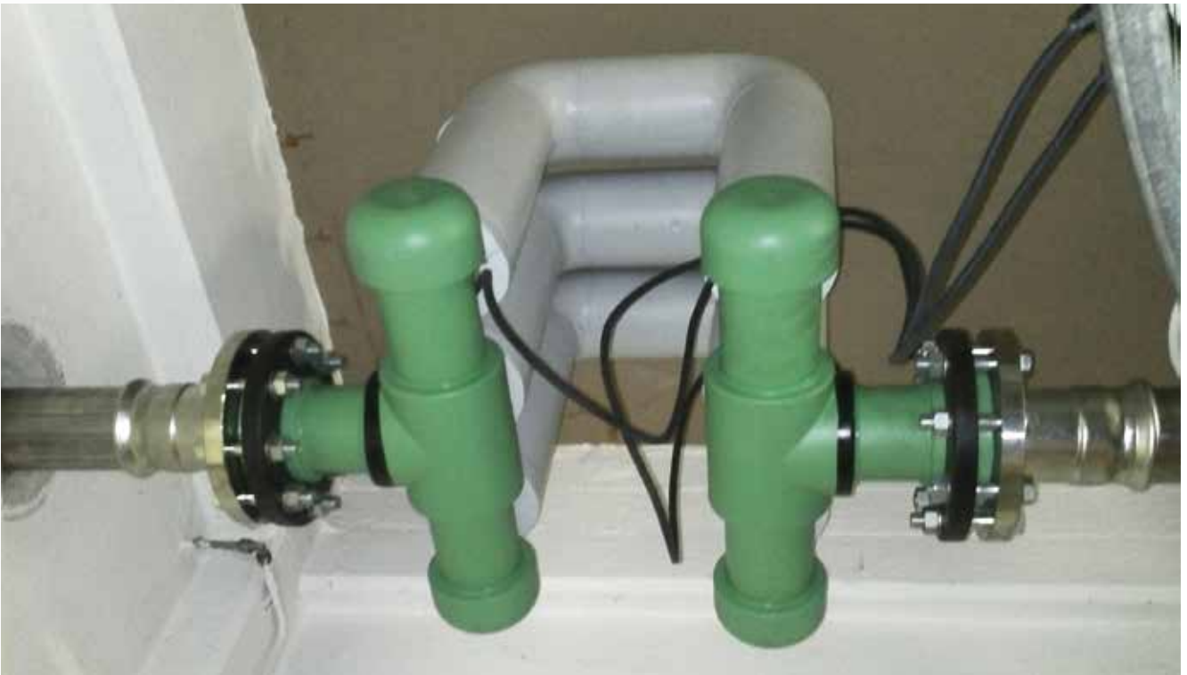
Industrial business, Stuttgart

The turbo pipe always replaces the induction pipe wherever larger volumes of water are moved.