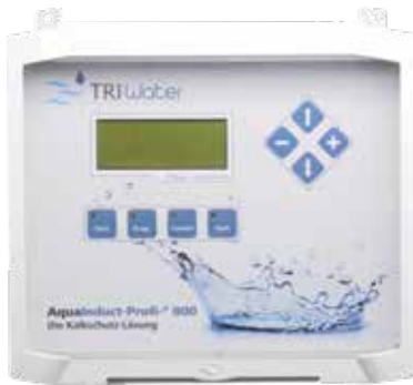
AquaInduct -profi-® 800